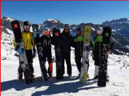
RADIAL PRO TEAM SURF PRO